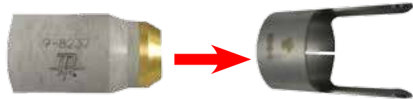
Shield Cup Body - Max Life 1 Torch OTD9/8237