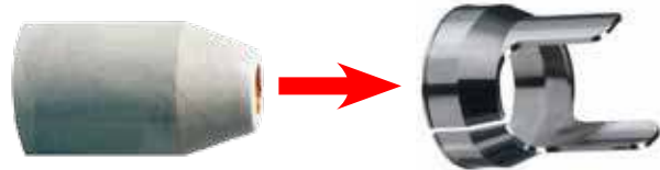
Shield Cup 1 Torch OTD9/8218