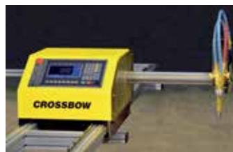
Maximum Oxy-Fuel Cutting Thickness of up to 100mm.