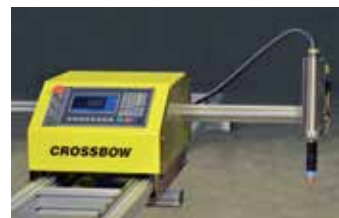
Maximum Plasma Cutting Thickness of up to 20mm.

Protects the CNC/Drive unit from pierce spatter and heat from the cutting process.